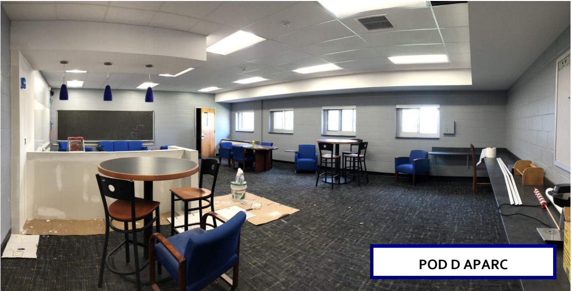
POD D APARC