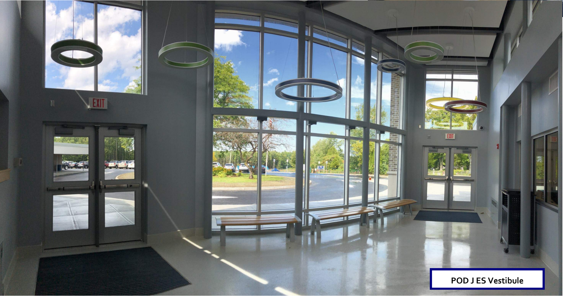
POD J ES Vestibule