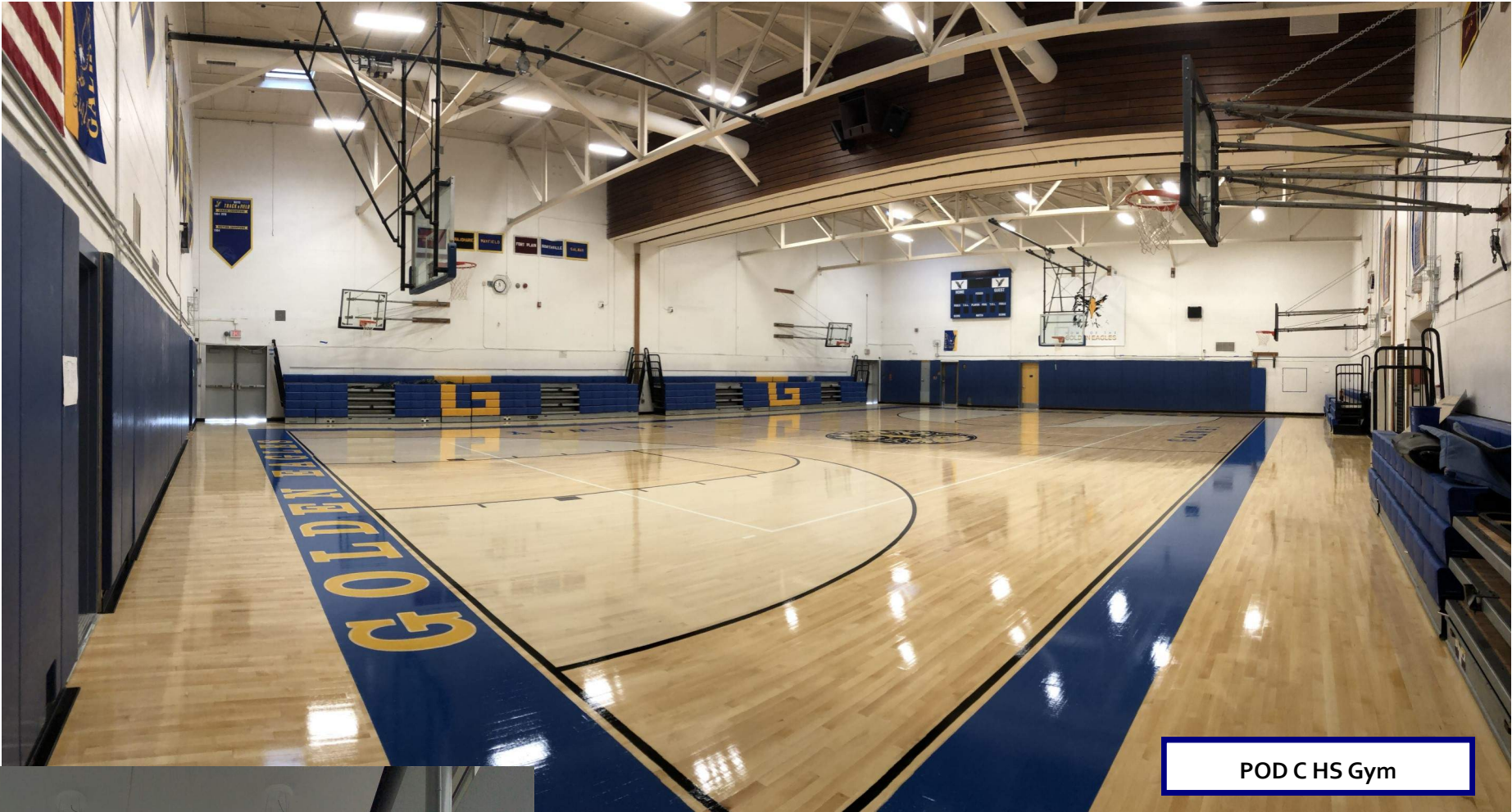
POD C HS Gym