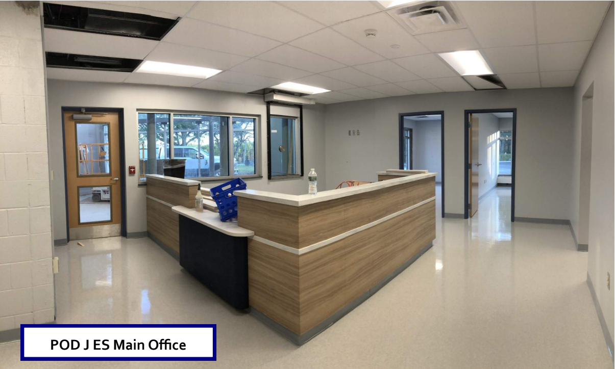
POD J ES Main Office