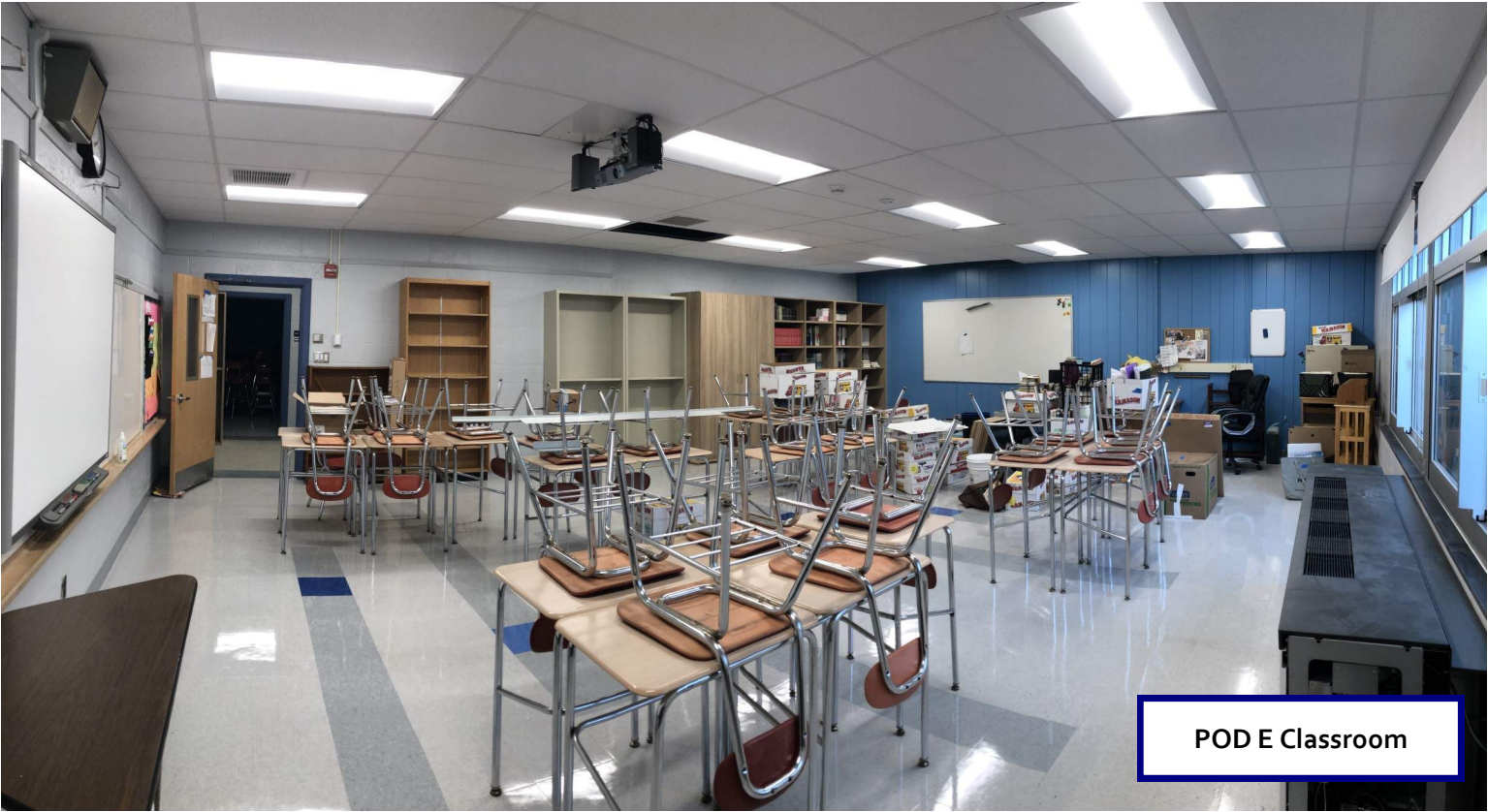
POD E Classroom