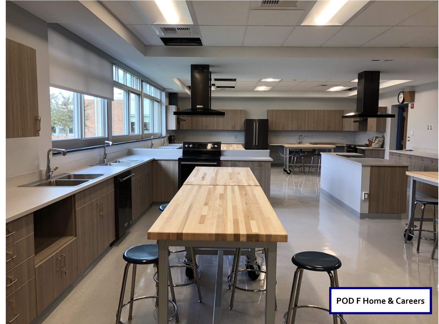
POD F Home & Careers